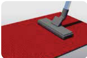
Vacuum clean top surface daily