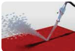
Water jet with soap periodically