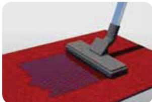
Injection/extraction cleaning periodically