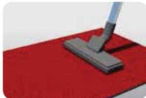
Vacuum clean top surface daily