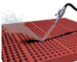
Water jet with soap daily