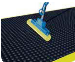
Damp-mop top surface periodically